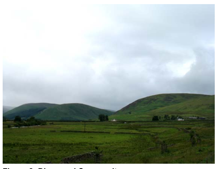
Figure 2: Dispersed Community

The Scottish Borders Council's Local Plan identifies specified areas of the Borders where it is considered that isolated housing may be appropriate. Anchor points are areas that can be found within the Area of Dispersed Communities as shown in the Local Plan Policy Maps. The provision of anchor points has been formulated in response to concerns over rural