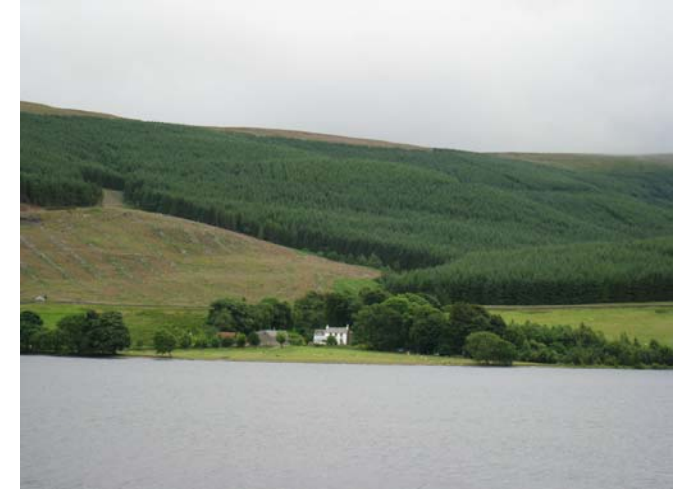
Figure 5: House against a background of trees

and utilities, including drainage and to integrate any lighting scheme with landscape proposals. In parts of the Borders where there is little existing planting and limited scope for landscaping due to exposure, such as the Lammermuir or Tweedsmuir Hills, particular care should he taken in the selection of the site and the design of the house.