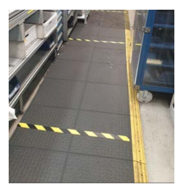
2m floor markings