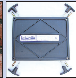
Double Floodtite cover