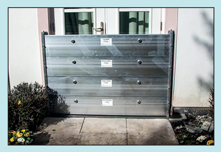
Fixed to the outside of the wall opening