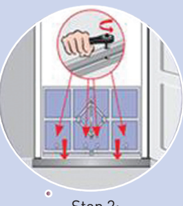
Step 2: Vertical expansion