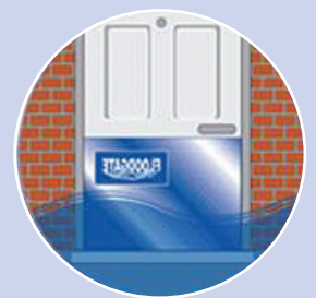
Step 3: Floodgate in place