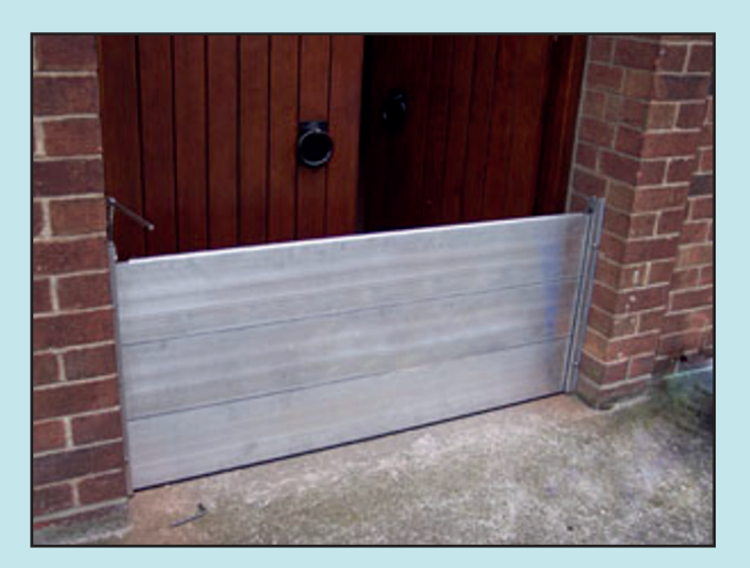
Wedged into the wall opening