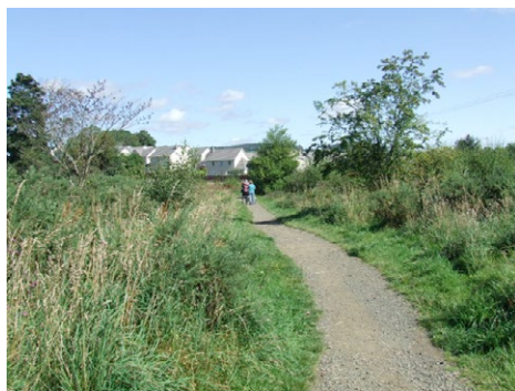
Burn Mill Path, Lauder

Lauder Nearby Lauder has a low level countryside path – the Burn Mill Path. Information locally or at www.scotborders.gov.uk/walking