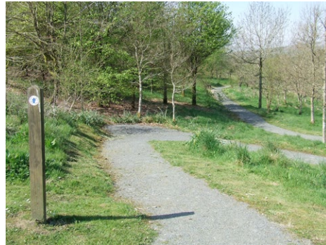
Paths at Ponds walk, Newcastleton Forest

For more information: please see the Paths around Newcastleton booklet at www.scotborders.gov.uk/walking Information on Newcastleton area and Liddesdale Heritage Centre www.visitnewcastleton.com and www.thereivertrail.com