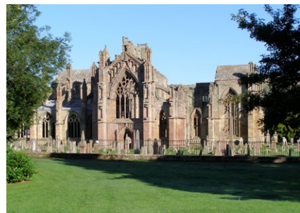
Melrose Abbey path Follow the path between Priorswood Gardens and Melrose Abbey for a flat level path with good views of Melrose Abbey. Play Park.