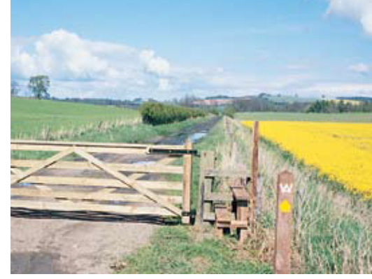
Old Railway line near Ploughlands

A stile leads you out to the A698 road (the Caddy Mann tearoom is about 400 metres to your left here). Cross the road with great care and follow the signs (also now showing St Cuthbert's Way) to the start of Dere Street , a clear track leading straight uphill. The track is followed for about 800metres, before you leave it to turn right (St Cuthbert's Way goes straight on). Go down a path which leads in turn to the access road at Mount Ulston . Follow this road downhill to join another road. Turn left and follow this road down to the A68.