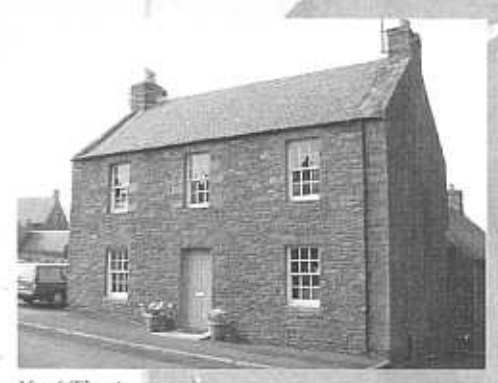
No 4 The Avenue

At the bottom of the Avenue on the left hand side there is an attractive two storey house (No 4), possibly a former estate building for Thirlestane Castle. In the past this building has been raised in height, note the line of the old roof on the west gable (side nearest the car park).