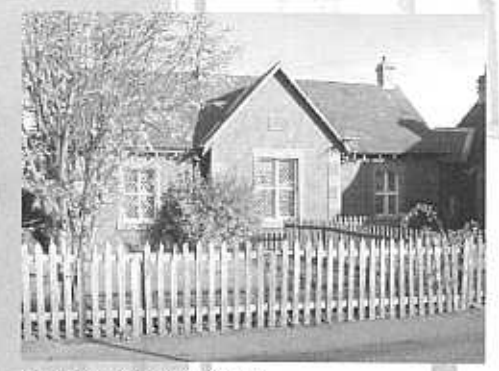
Lord Lauderdale's School