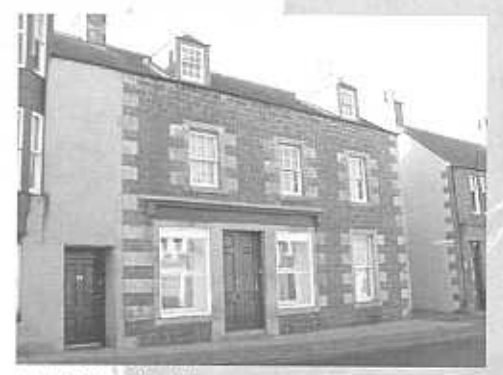
22-26 West High Street

Nos 22-26 West High Street all have 19<sup>th</sup> century frontages including one with an oriel (projecting) window feature. These properties were sensitively repaired and revived by the Scottish Historic Buildings Trust in 1989.