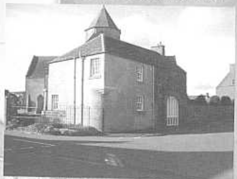
The vestry with former cart opening for the Hearse

In the turbulent years of the mid 17th century, there was a struggle for control of Scotland's religion. The minister for Lauder Parish hetween 1638 and 1649 was James Guthrie. He was known locally as the 'little man that could not bow'. He was also a fanatical witch hunter and it was said that during his time in office. the Town Hall had a waiting list for women waiting to be tried for witchcraft! Guthrie was vehement in his opposition to the 'Engagement' where the Church of Scotland sided with King Charles I and in 1638, he signed The Covenant, After the restoration of the monarchy he was tried for high treason and executed (1661). His last words were said to be "The Covenants, the Covenants shall yet be Scotland's reviving".