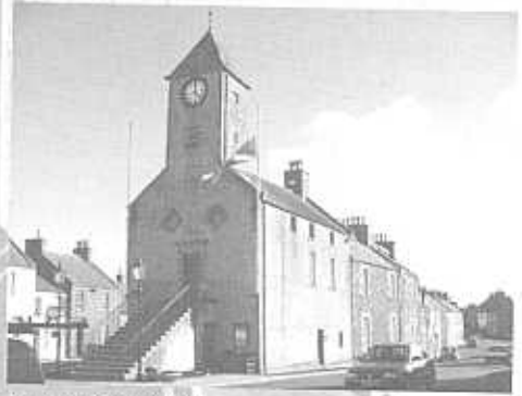
Lauder Town Hall

On exiting the churchyard, you will see Lauder Town Hall in front of you.