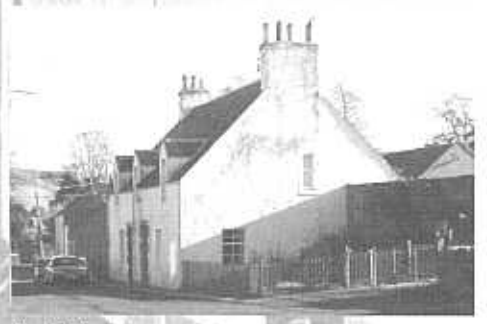
No 4 The Row

No 4 The Row was built by the burghers in 1795 as a meeting house and church. It has subsequently been used as a school, joiners shop and more recently a house.