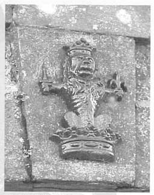
Maitland Family Arms

From here, the trail can be extended to take in a visit to Thirlestane Castle. If you wish to extend your walk please refer to the notes on pages 18-19.