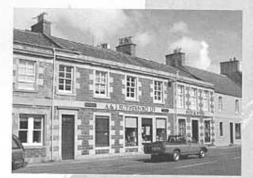
Rutherfords General Store

To the left of the Black Bull Hotel is Rutherfords general store. Note the distinctive yellow sandstone quoins and dark whinstone walls.