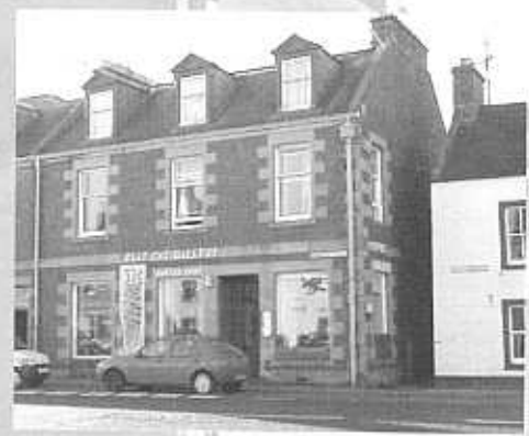
The site of Jonny Cope's

The Avenue was once the main approach to Thirlestane Castle and was lined with trees. Beyond the gate at the bottom of the Avenue, this tree-lined path has recently been replanted and there are plans to re-open this route to the castle in the future.