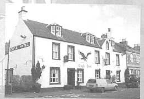
The Eagle Hotel

At the top of the Avenue to the left of Rutherfords shop is the Eagle Hotel. In the past this Hotel was known as the Eagle Inn and was one of several inns providing stages for changing horses on the road between Edinburgh and the North of England as well as providing rest on the local routes to Jedburgh, Kelso and Duns.