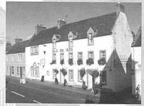
Black Bull Hotel

The Black Bull Hotel dates from the 18th century. The hotel is reputedly the site of a peell, although no trace of such a building exists today. The land was sold in 1721 but the sasine does not mention a peel. The land was sold again in 1737 although this time the sasine does record a 'high house called the peel'. It seems reasonable to assume therefore that a peel may have been built between 1721 and 1737 but it is strange that a defensive building should be built during a period of peace and prosperity for the burgh.