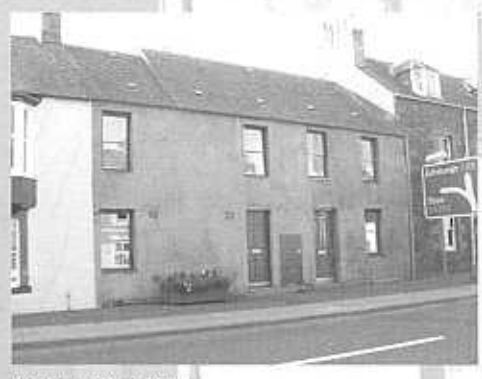
48 West High Street