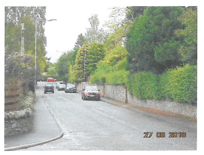
Caledonian Road – North side with Fire Station & Ambulance Station