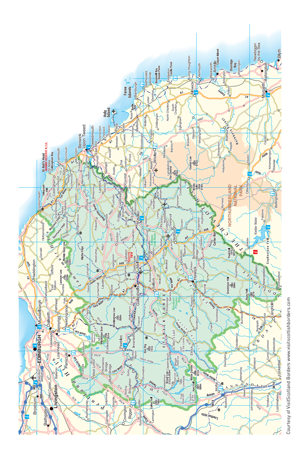
4 | WELCOME TO THE SCOTTISH BORDERS | INFORMATION GUIDE