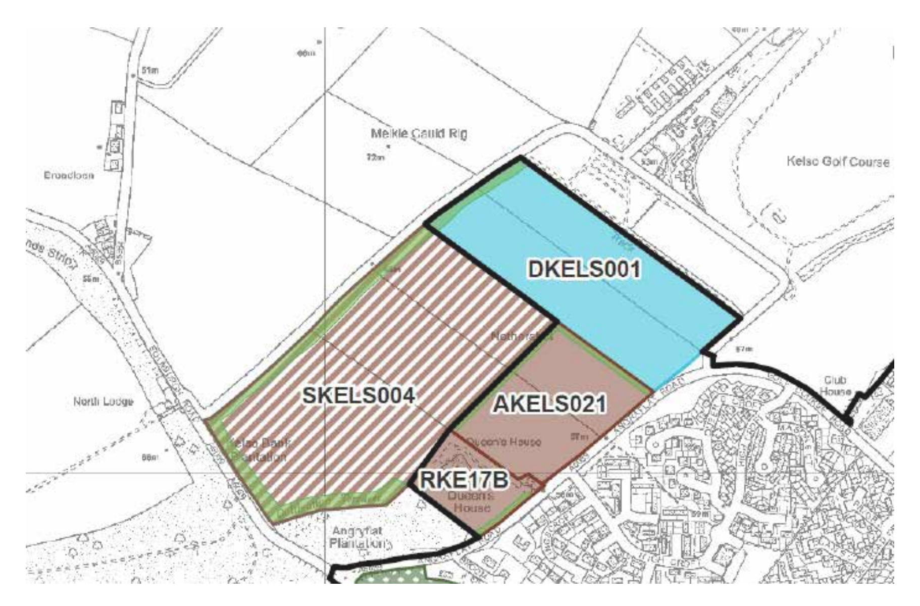
Nethershot, Angraflat Road, Kelso