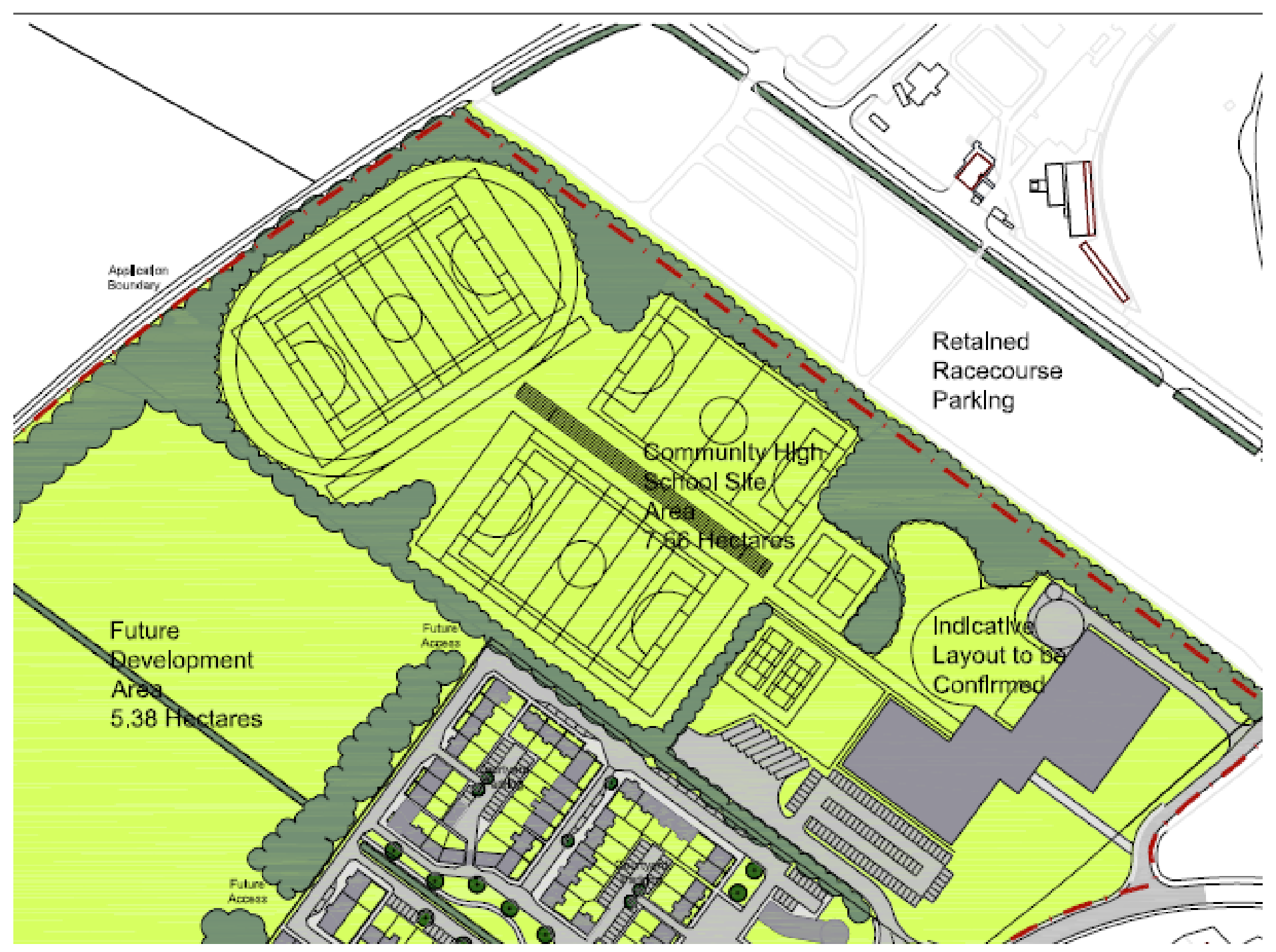
Fig 4 - Nethershot Indicative School Site Layout