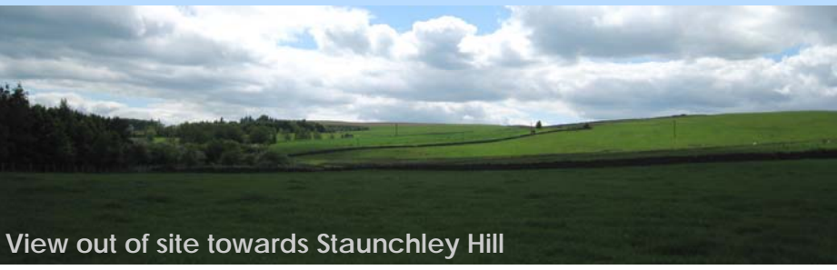
Figure 4-View out of site

The site is rural in character, with an open aspect and currently