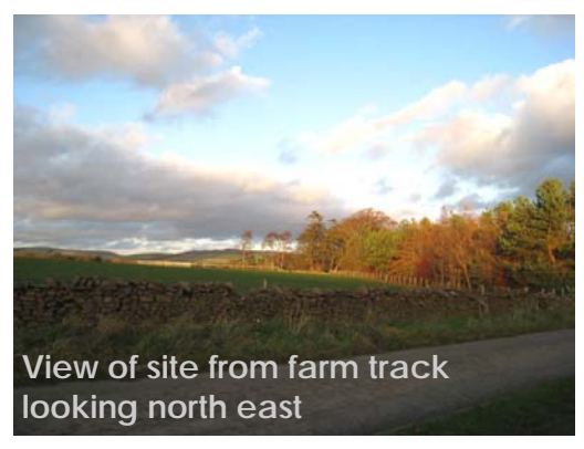
Figure 2-View of Site