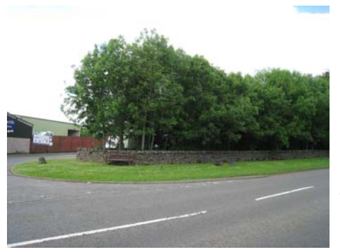
Figure 10 - Existing Amenity Open Space on Entrance to Industrial Estate