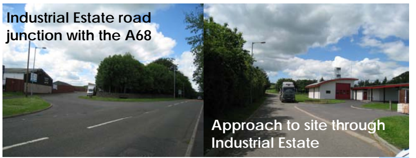
Figure 9 - Current Access Arrangements