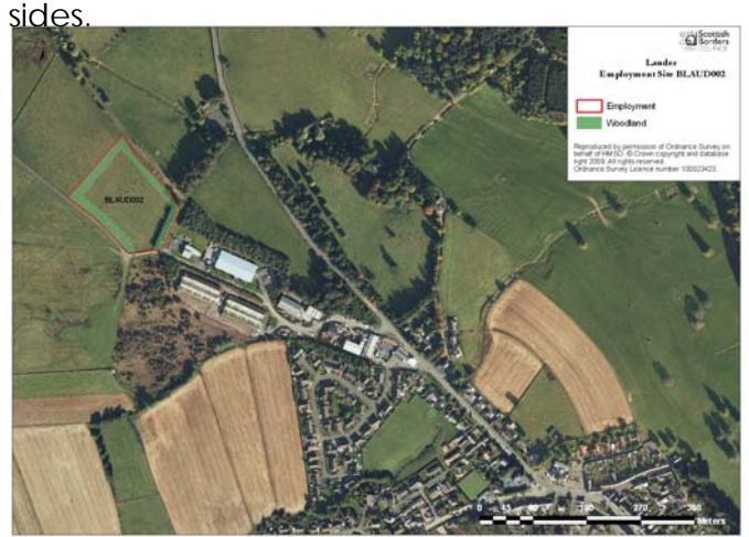
Figure 1-Local Context

The site is located to the north of the existing safeguarded employment site and is surrounded by countryside on three