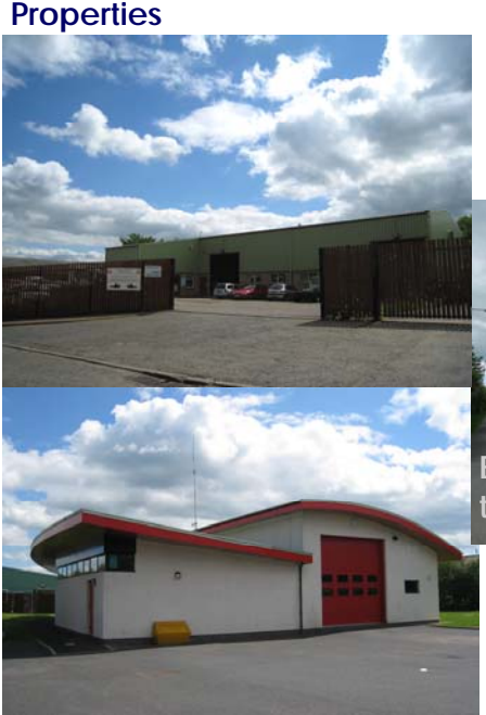
Figure 7 - Neighbouring Properties