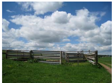
Figure 8 - Farm Animal Enclosure in Adjacent Site Located to North-East