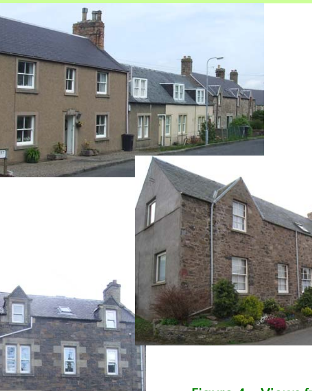
Figure 4 – Views from within the village