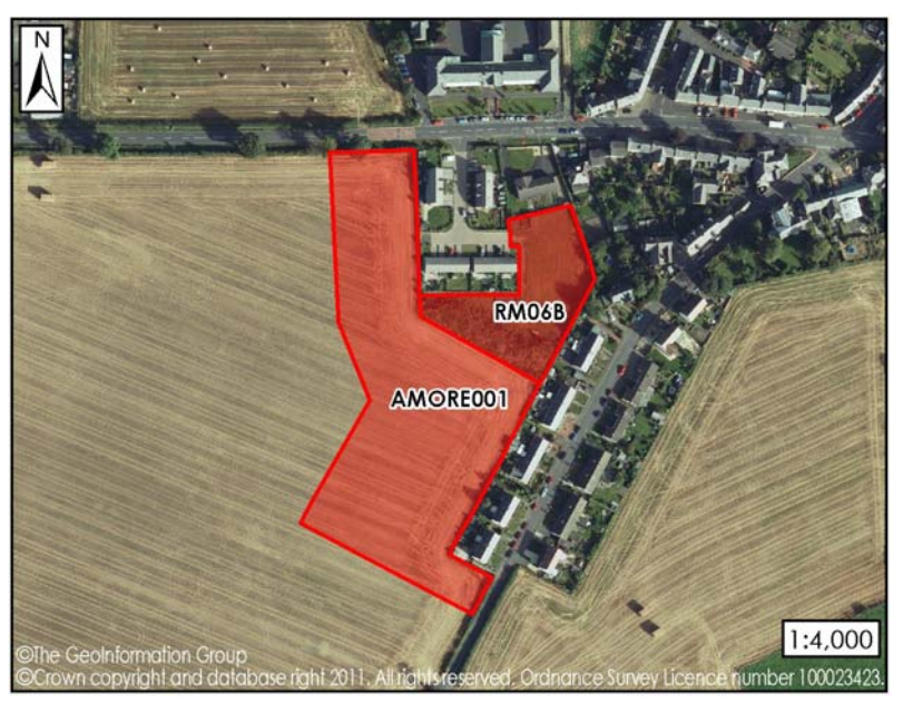
Figure 1 - Aerial image of Local Context

Morebattle is located 8 miles south of Kelso. The two allocated housing sites are located on the western side of the village adjacent to 'Renwick Gardens', an Eildon Housing development which comprises eight units of one and one and half storey properties.