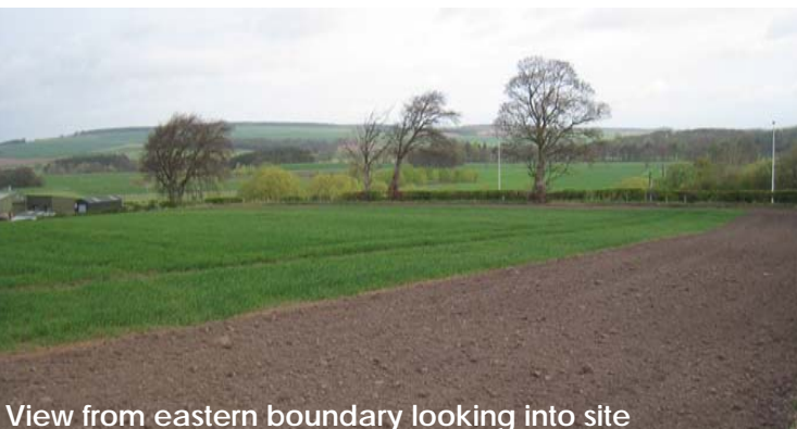
Figure 3 – Views from within and around AMORE001