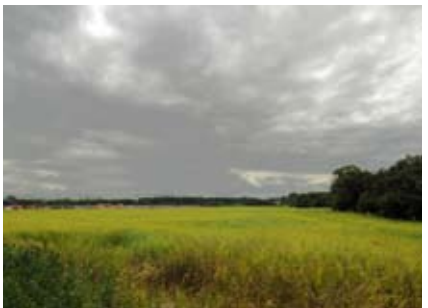
above - the site from the adjacent main roa