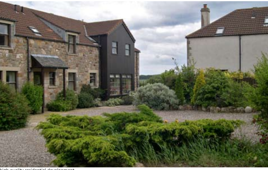
high quality residential development

landscape context and development should include proposals for an adequate landscape buffer (see Developer Contributions)