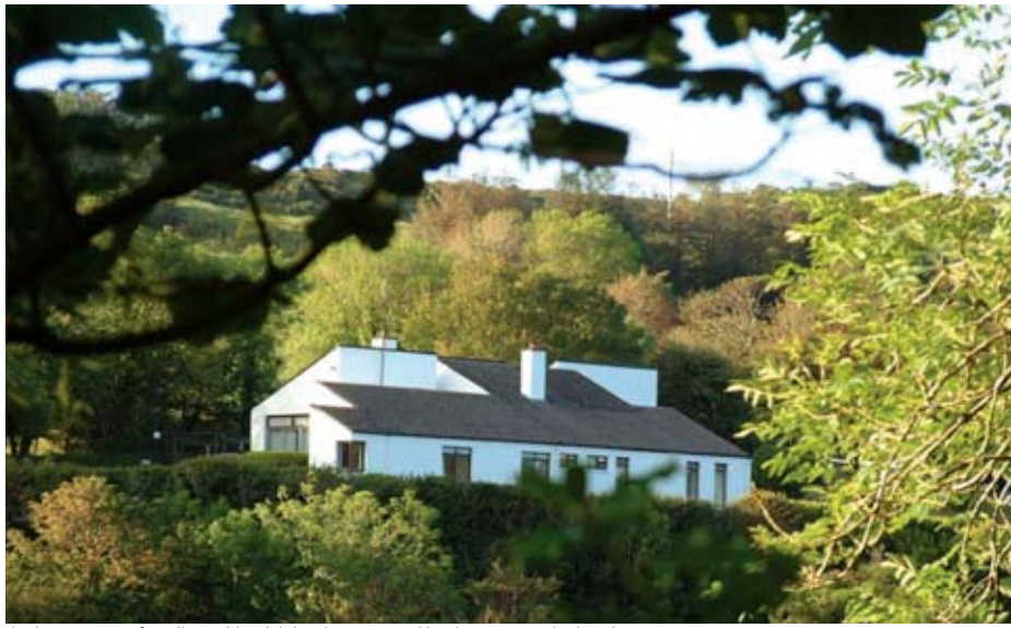
the importance of quality residential development and landscape on a sloping site

account of these comments, as may be appropriate for the site development.