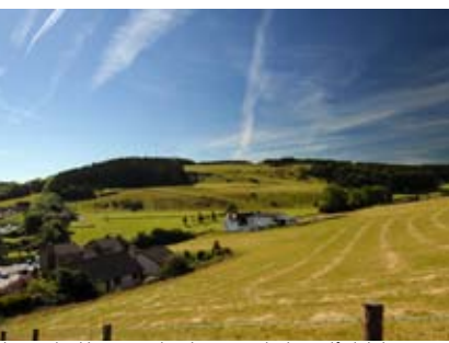
above - looking over the site towards the golf below - adjacent private housing