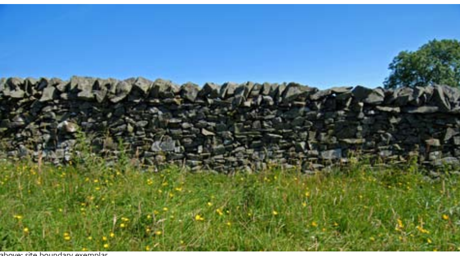
above: site boundary exemplar below: residential landscaping