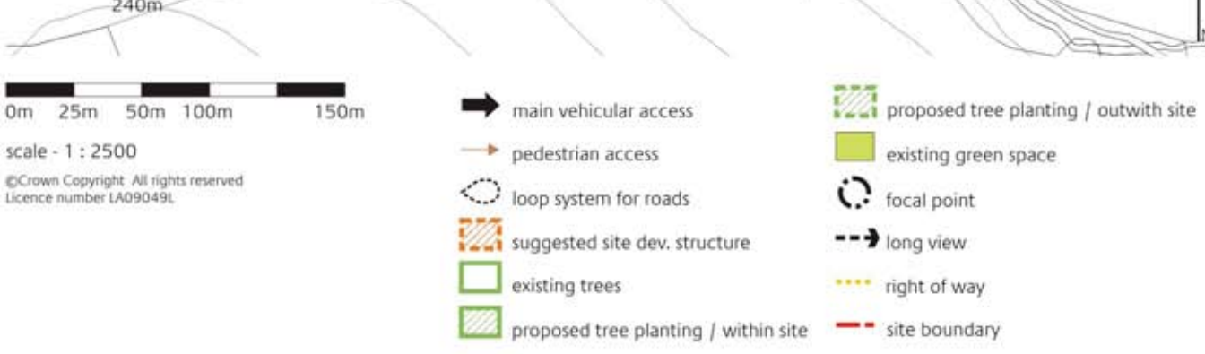
fig 1 - Design Guidance Plan important Scots Pine potential focal point woodland existing green space retain beech hedge Eddleston Primary School right of way new woodland 220m 230m 220m 230m new woodland along watercourse permeable boundary retain stone dyke 240m