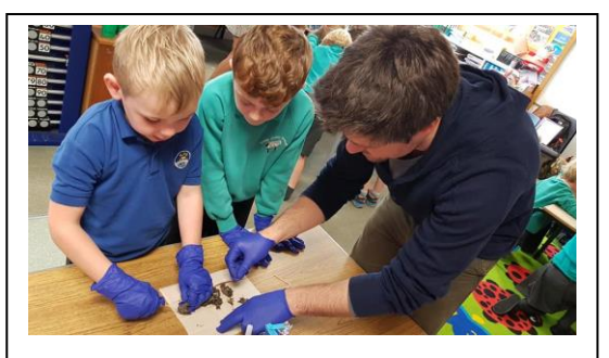
Children dissecting owl pellets to investigate what they eat.

Children are encouraged to appreciate the wonders of nature and develop responsible attitudes towards the natural environment. Above all, we nurture our pupils' natural curiosity and their desire to create and work in practical ways.