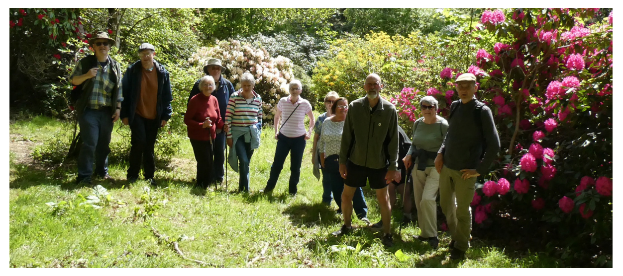
Coldstream Walk It Group

In 2022 - 2023 over 4,100 hours were delivered by Volunteers for the Walk It Project.