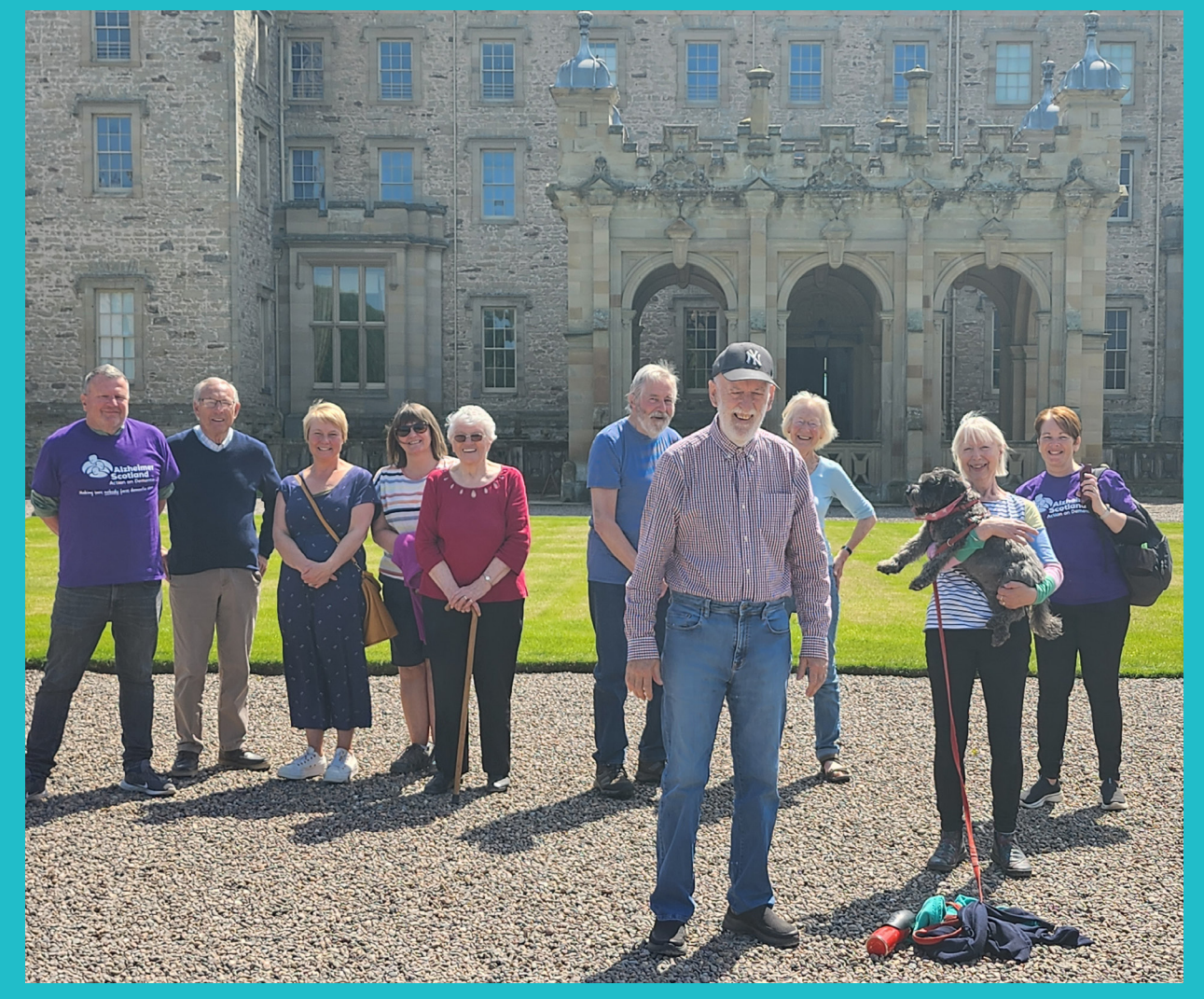
Alzheimer's Walk It Group - Floors Castle