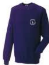
Primary 1 - Primary 6