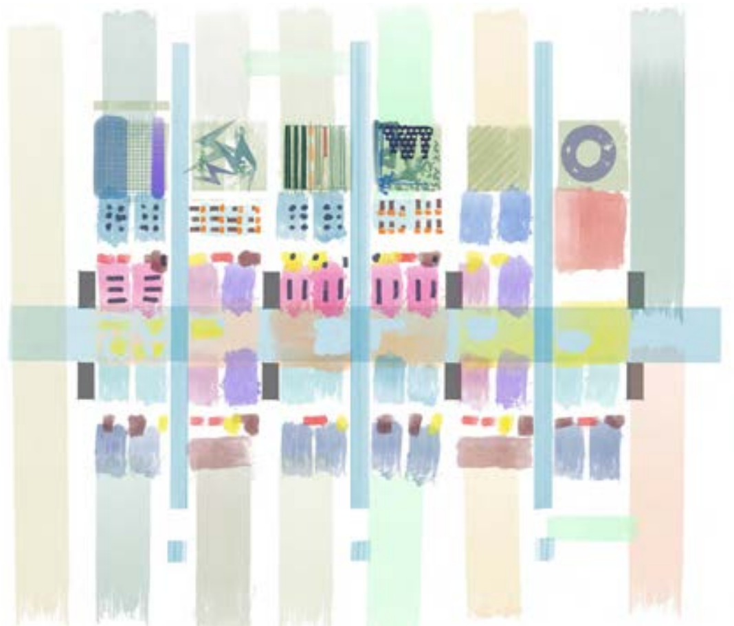
Concept - A rich learning environment