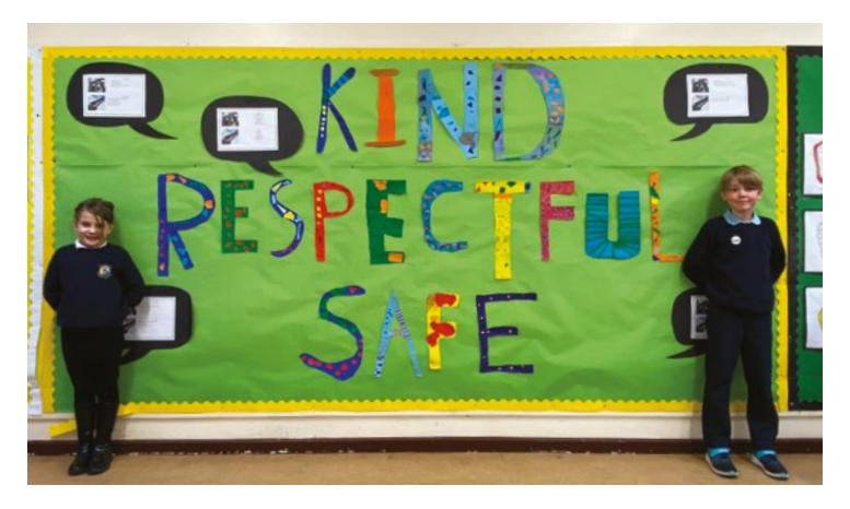
Nurturing pupils and providing a loving, caring and safe environment is at the heart of our school