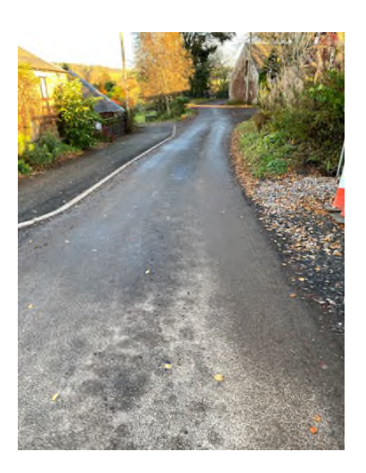
"Explore the potential for a secondary access from the extreme south westerly corner of the site which links Justice Park and the possibility of a further pedestrian/cycle linkage, in the interests of connectivity and integration of the existing street network" See Further Notes F., this is simply not possible

When these safety issues were highlighted with Planners in informal discussions in late 2020, they were dismissed with a standard "they can be mitigated" e.g., the road does not need to be widened in its entirety, a footpath does not need to be present along the entire length of road etc. However, this simply is ignoring the fact that the road is not suitable for access for a large development and there is no possible way to make it safe. With no continuous pavement possible and no space for 2 cars to pass safely along almost the entire stretch of road, families and children will be forced to walk on the road. This is an unacceptable risk .