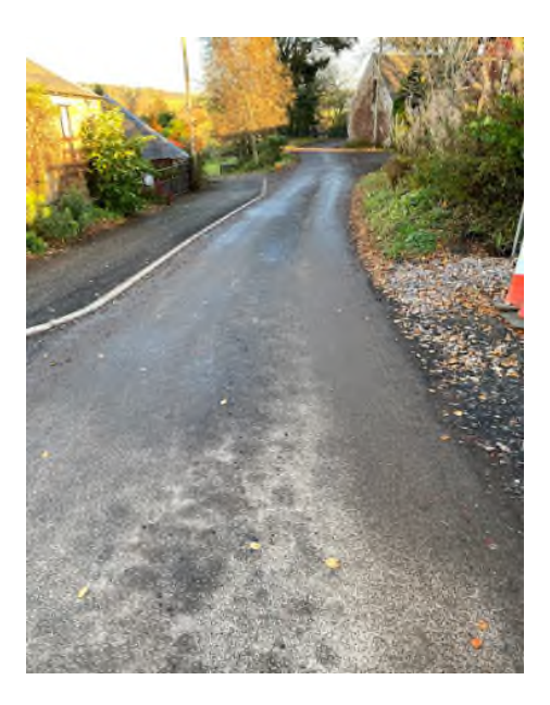
"Explore the potential for a secondary access from the extreme south westerly corner of the site which links Justice Park and the possibility of a further pedestrian/cycle linkage, in the interests of connectivity and integration of the existing street network" See Further Notes F., this is simply not possible

When these safety issues were highlighted with Planners in informal discussions in late 2020, they were dismissed with a standard "they can be mitigated" e.g., the road does not need to be widened in its entirety, a footpath does not need to be present along the entire length of road etc. However, this simply is ignoring the fact that the road is not suitable for access for a large development and there is no possible way to make it safe. With no continuous pavement possible and no space for 2 cars to pass safely along almost the entire stretch of road, families and children will be forced to walk on the road. This is an unacceptable risk .