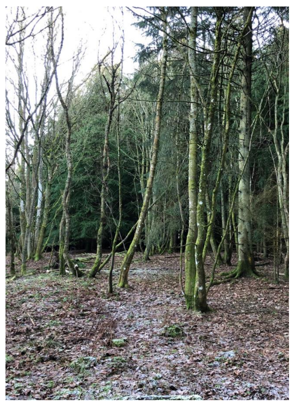
Figure 4 - Edge of commercial woodland