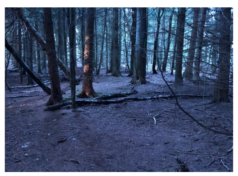
Figure 5 - Bare commercial woodland floor