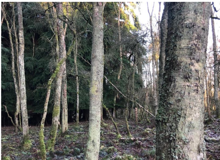
Figure 3 - Edge of commercial woodland