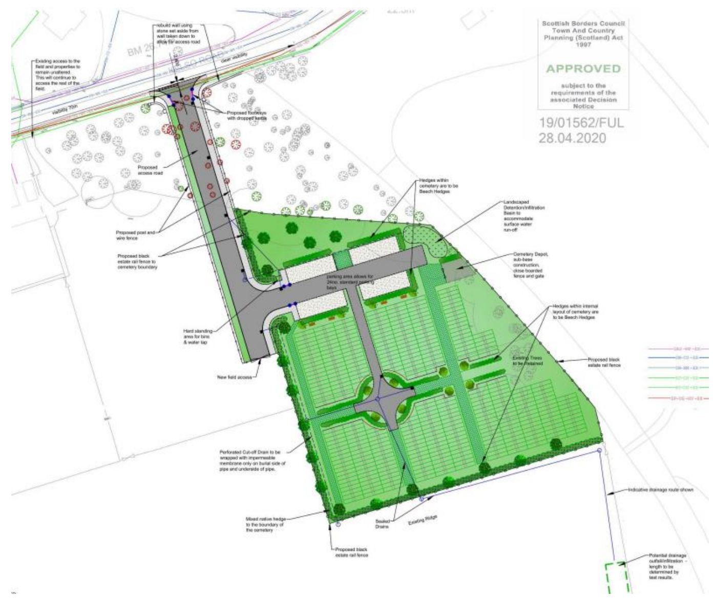
Figure 2: Approved Layout of new Coldstream Cemetery, located on part of Ladies Field land

2.8. On 7 December 2020 a caravan park was given consent on the fields to the west of Ladies Field. The caravan park will cover 6ha of land extending west on the south side of the A698 . Again, we do not dispute the policy justification for the consent of the caravan park but our point is that this consent, when developed, will fundamentally change the landscape as Coldstream is reached from the west on the A698. For example, the visualisation for the development at completion of construction is shown at Figure 3 below and clearly the impression is that this forms the entrance to the settlement of Coldstream.