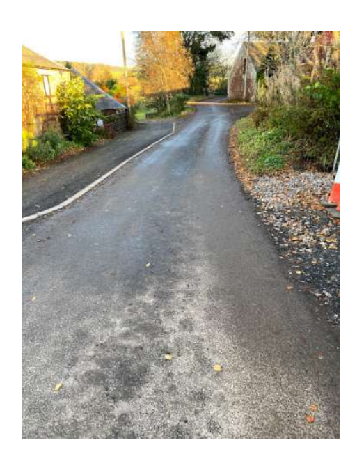
"Explore the potential for a secondary access from the extreme south westerly corner of the site which links Justice Park and the possibility of a further pedestrian/cycle linkage, in the interests of connectivity and integration of the existing street network" See Further Notes F., this is simply not possible

When these safety issues were highlighted with Planners in informal discussions in late 2020, they were dismissed with a standard "they can be mitigated" e.g., the road does not need to be widened in its entirety, a footpath does not need to be present along the entire length of road etc. However, this simply is ignoring the fact that the road is not suitable for access for a large development and there is no possible way to make it safe. With no continuous pavement possible and no space for 2 cars to pass safely along almost the entire stretch of road, families and children will be forced to walk on the road. This is an unacceptable risk .