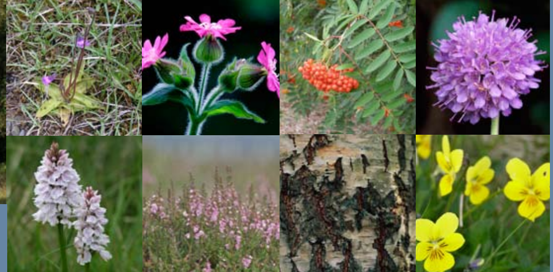
1. Butterwort 2. Red campion 3. Rowan 4. Scabious 5. Orchid 6. Heather 7. Silver birch 8. Mountain pansy

Total ascent - 300 metres/ 1000 feet approx