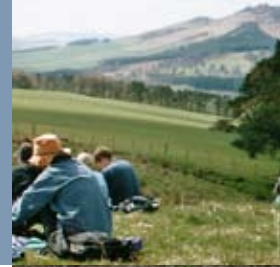
1. Walkers on Black Law 2. Ewe with lamb 3. Badger 4. Bedrule Church 5. Leyden Monument

At the south-west corner of the Green is the Text House, with its enigmatic four-part inscription 'Tak Tent in Time, Ere Time be Tint, All was Others, All will be Others'. Denholm was the birthplace of Sir James Murray (1837-1915), who became editor of the New English Dictionary in 1879 and devoted most of the rest of his life to this massive work.