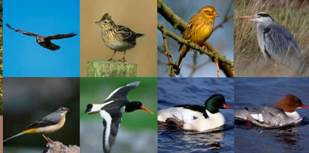
1. Common buzzard 2. Skylark 3. Yellowhammer 4. Grey heron 5. Grey wagtail 6. Oystercatcher 7&8. Goosander

There are car parks at Murray's Green, Jedburgh, next to the Tourist Information Centre and bus station, and at Teviotdale Leisure Centre, Hawick. There is also a large car park at the Common Haugh on Victoria Road, Hawick. Roadside parking is usually possible in Denholm but please use consideration and do not block access.