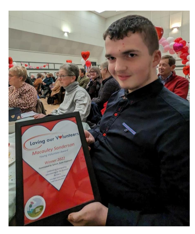
Young Volunteer of the Year Award. A Wonderful Achievement!

The following are examples of how the Council has sought to achieve this outcome: